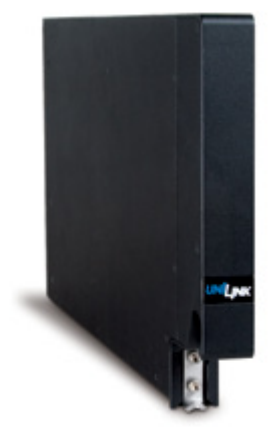
UniLink UL-800/801 CMU

Combined with the Universal Avionics Satellite-Based Augmentation System (SBAS)–Flight Management Systems (FMS), the UniLink UL-800/801 CMU provides an opportunity to take full advantage of the safety and efficiency benefits that advanced data link capabilities offer.