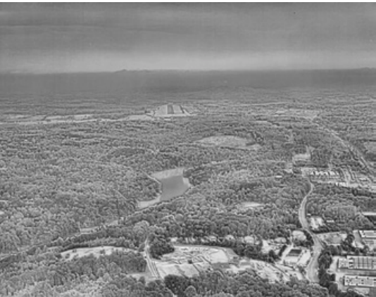
Natural Vision Enhanced Vision

EVS can be used tactically since it is created from real-time data sources and it allows pilots to see what is in front of the aircraft.